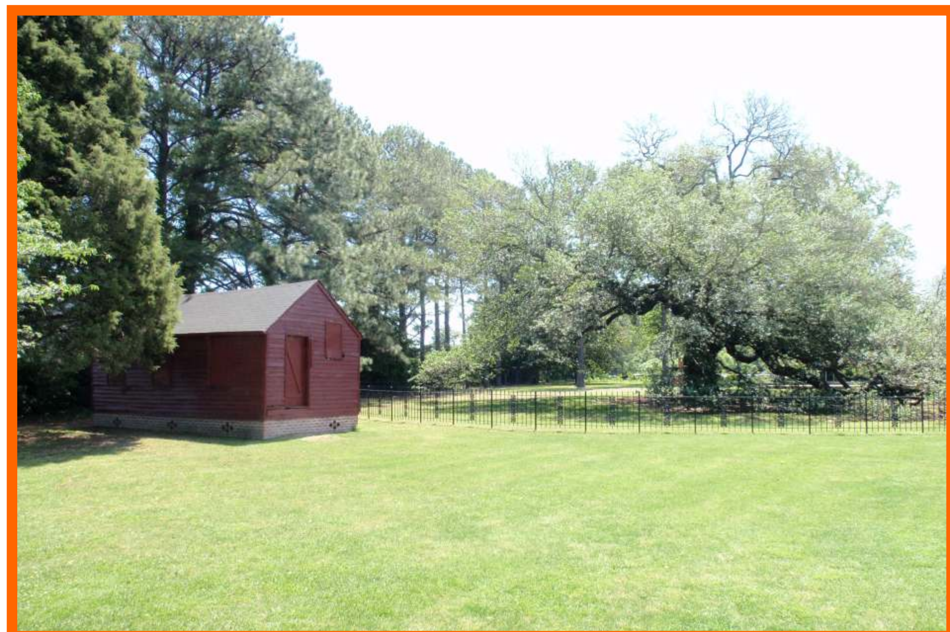
Emancipation Oak National Historic Landmark