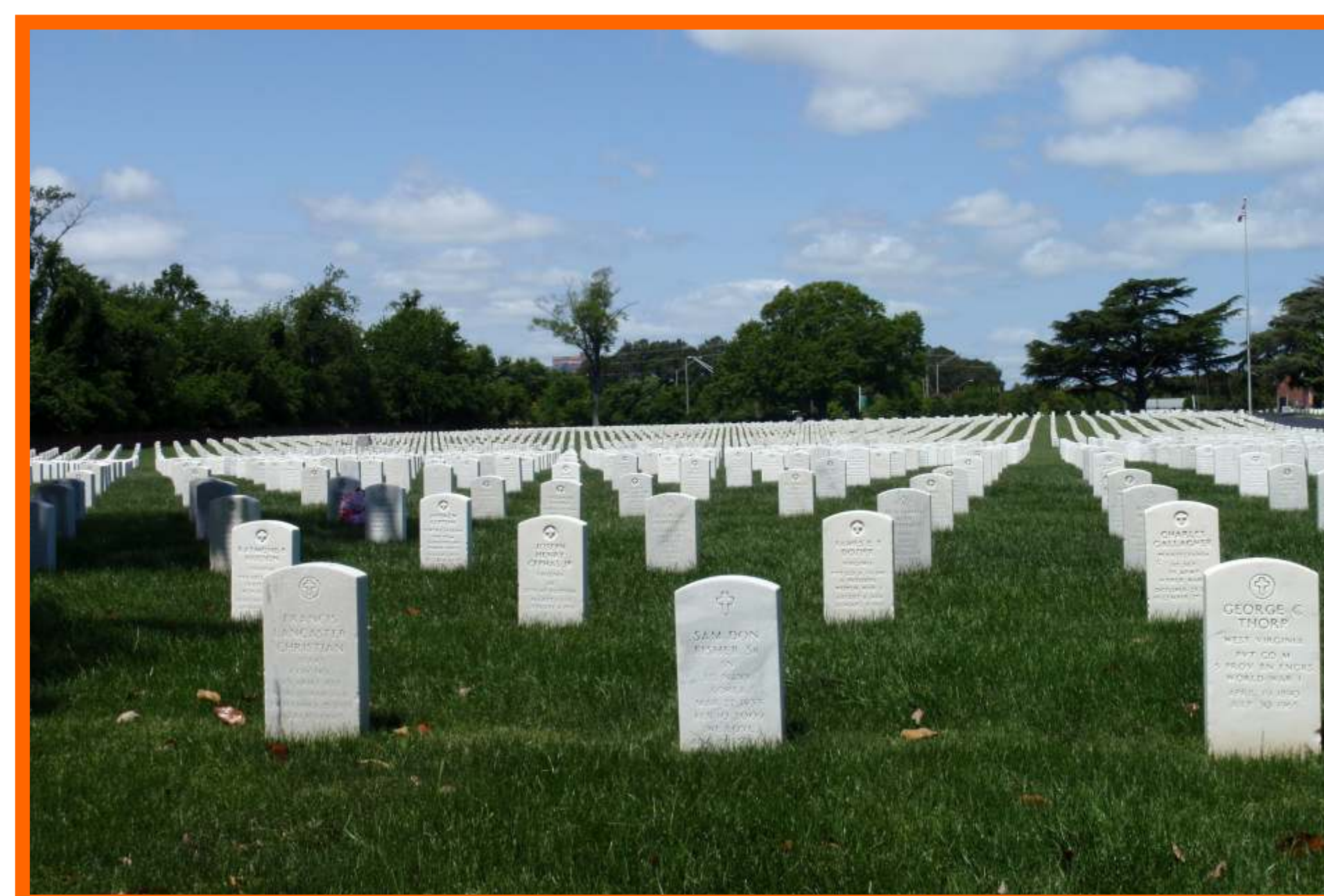
Hampton National Cemetery