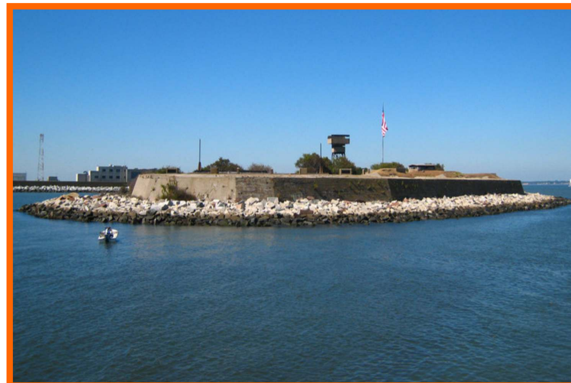
Fort Wool near South Tunnel Portal