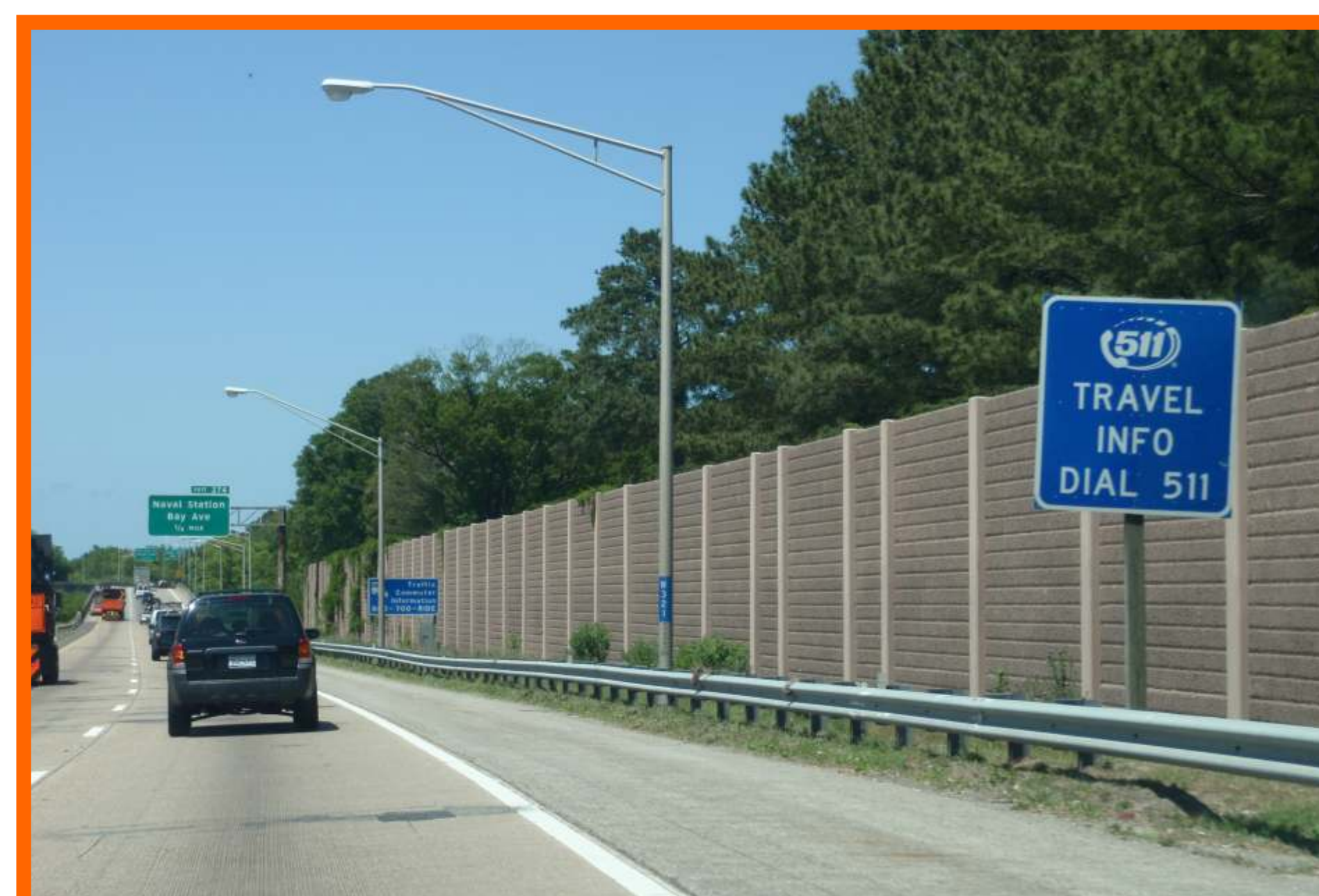
Noise Barriers along I-64 in Norfolk