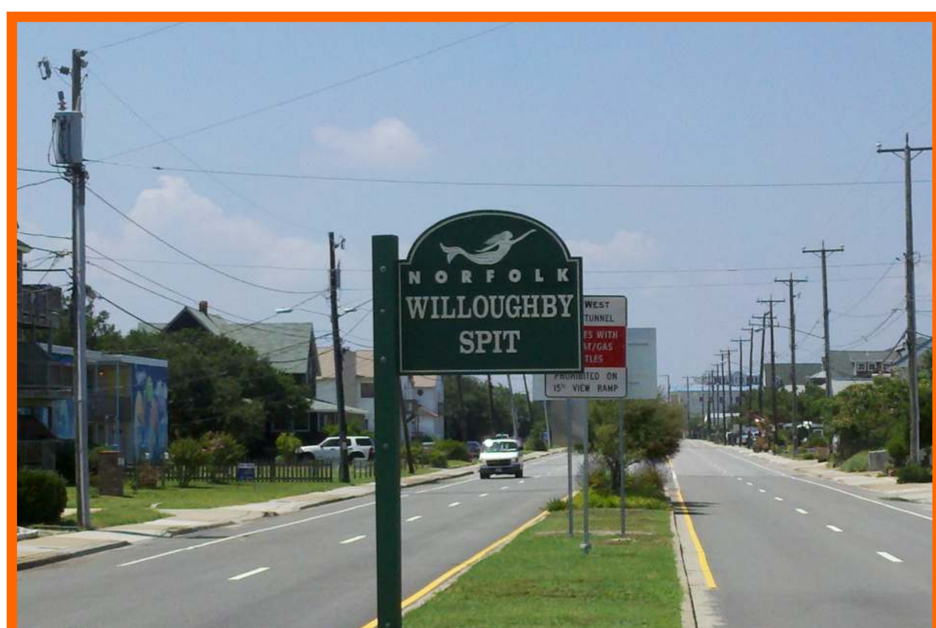
Residences on Willoughby Spit