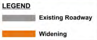
Build-8 Managed Alternative I-664 to HRBT Mainline

Not to scale Note: Bus service could operate in managed lanes